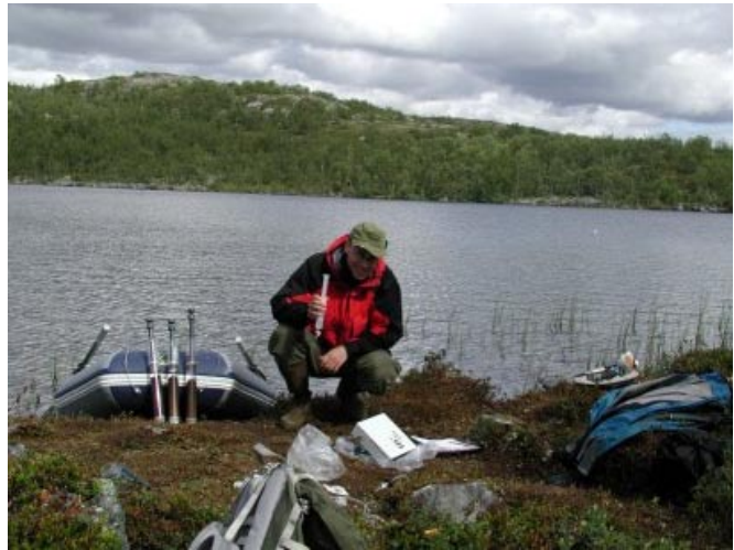
Lake Diktar Erik where the new eddy correlation tower will be set up.

These measurements will facilitate other carbon flux measurements presently taking place in the same lake. Within the project 'Net carbon flux in lakes and its importance for the carbon balance in different vegetation environments' (funded by The Swedish Research Council) we have this spring started up a sampling program to quantify the carbon fluxes to the lake, from the lake and processes within the lake contributing to these fluxes. Our research in the last years has indicated that most lakes in the region (alpine – conifer forest lakes) are sources of CO 2 to the atmosphere. The project is a part of a larger scale effort at the Abisko Scientific Research Station with a goal to quantify carbon fluxes in the Torneträsk drainage basin. For further information please contact Dr Anders Jonsson, Climate Impacts Research Centre (CIRC), Abisko Scientific Research Station, SE 981 07 Abisko. E-mail: Anders.Jonsson@eg.umu.se , Phone: +46 980 40218, Fax: +46 980 40280, Web: http://www.eg.umu.se/circ/