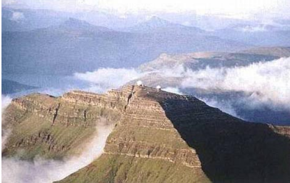
The Sornfelli Meteorological Station

two years of operating the Sornfelli station as part of their AMP-V programme (Arctic Monitoring Programme - Knowledge Transfer) succeeding three years of funding from the Danish Research Councils.