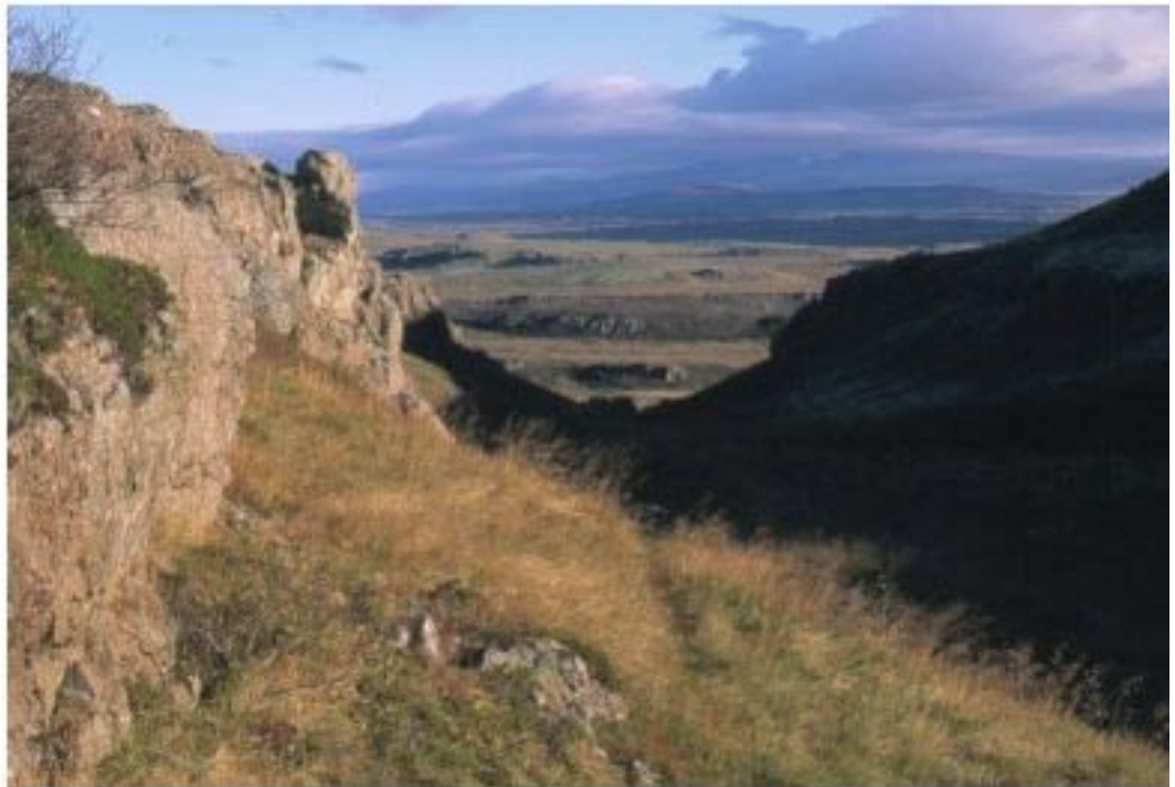
View from Litla-Skard Field Site in Iceland.