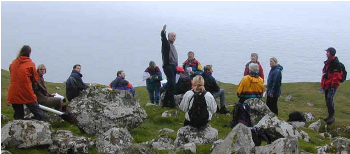
Participants at the Nordlink course, that was held in the Faroe Islands in June, on excursion.

The Sornfelli station is the first and still the only meteorological station within the arctic zone of the Faroe Islands above 300 m above sea level. Visits to the station seem to become more frequent as time passes and the station proves its durability. The interest for the station is important as we are working with applying for additional funding to operate the station on a permanent basis.