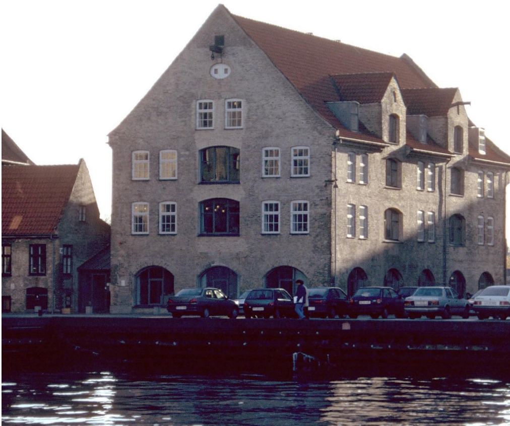
Danish Polar Centre in Copenhagen